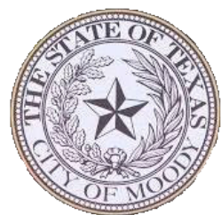
City of Moody