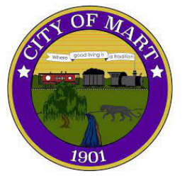
City of Mart