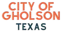
City of Gholson