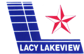
City of Lacy Lakeview